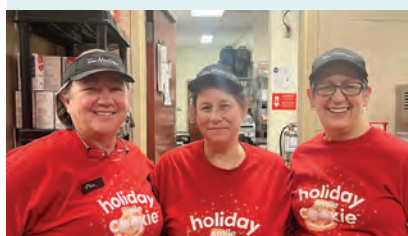
Tim Horton's Smile Cookies