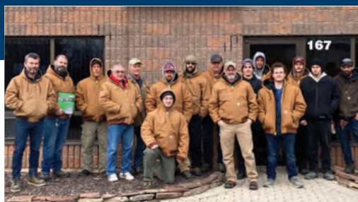
Mike Moore Construction Ltd.