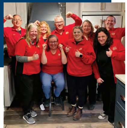
Heritage Home Hardware