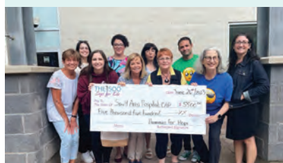
Harmonies for Hope - Soo Sings For Kids

So many groups and organizations came together in support of Sault Area Hospital Foundation this year. You put together athletic events (like fun runs and golf tournaments), gave performances, held lotteries, organized car shows, offered special menu items, and did school fundraisers!