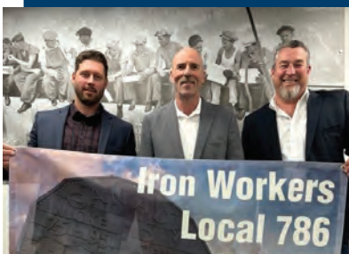
Iron Workers 786