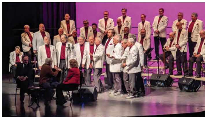
Northland Barbershop Chorus