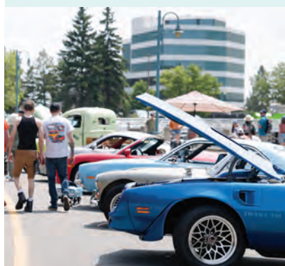
Queen Street Cruise