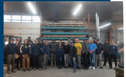
Henderson Metal Fabricating