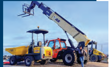
Construction Equipment Co.