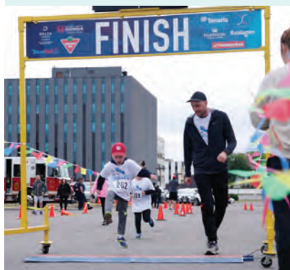
Run the Great Lakes