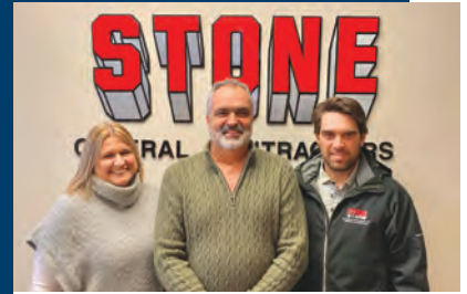
George Stone and Sons