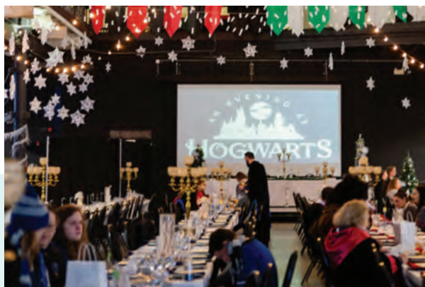
An Evening at Hogwarts